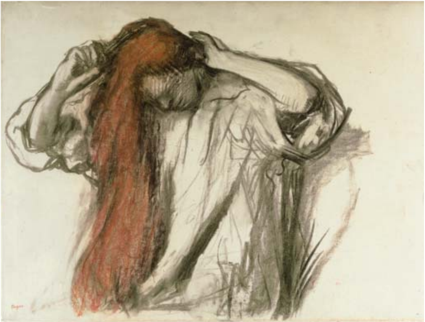
Woman Combing Her Hair, Edgar Degas. Charcoal and pastel.

In the vestibule below belonged to this flat a letterbox into which no letter would go and an electric button from which no mortal finger could coax a ring. Also appertaining thereunto was a card bearing the name “Mr. James Dillingham Young.”