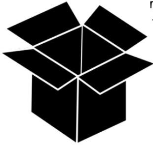
The black box